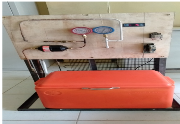
Fig. 3. Appearance of cold storage