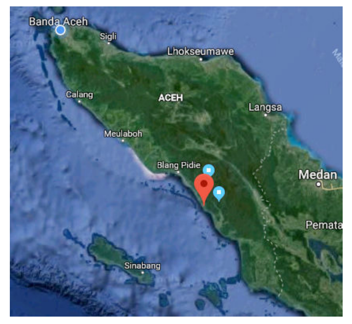
Fig. 1. Location of Gunung Kerambil

Samples of marbles from Gunung Kerambil were collected from Marble Production Unit in Tapaktuan, South Aceh, Indonesia. The location of Gunung Kerambil is shown in Figure 1.